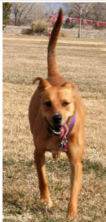
Former invisible dog Tula Rose

The inimitable story of Tula Rose cannot be told in a few paragraphs, it deserves a book. We are sure the future will continue to reveal this beautiful dog's personality and unique talents.